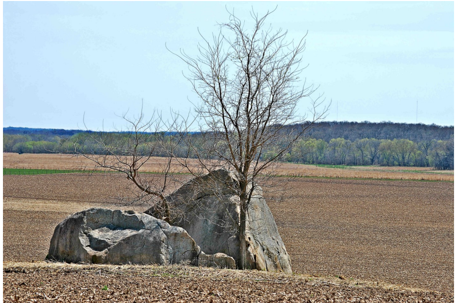
Standing Rock is a glacial erratic located just southwest of Lisbon, Iowa. The granite boulder rests on private property and can be seen from the gravel road and on internet aerial maps. For decades Standing Rock has been a landmark and according to local lore, may mark a boundary for the 1832 Black Hawk purchase of land by the federal government. Photo taken on May 4, 2014.

Still, it is an imposing sight to see a two story, house size boulder resting on fertile Iowa soil.