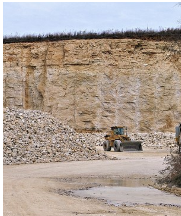
This active quarry northeast of Fayette, Iowa produces limestone product primarily for roadway use. Side cuts in the quarrying process expose strata detail revealing nearly continuous source material and conditions below while the top one-quarter layer displays an alternative source composition.

Today this solidified mud and ooze from shallow seas makes a great crushed rock product that is used for road maintenance, building material and ag lime. So the next time you take a drive near Fayette you will know where the source material is found, mined and distributed.