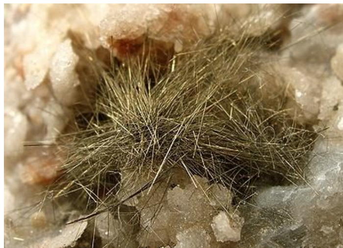
Figure 1. A cluster of millerite crystals in quartz.

It has also been suggested that nickel was concentrated by seaweed and other marine plants. Others suggest that it leached out of the widespread and very "nasty" Pennsylvanian black shales that once covered most of the Midcontinent. Again, millerite should be more widespread if