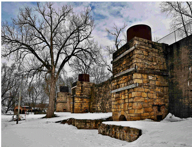
The Hurst Lime Kilns are located a mile north of Maquoketa, Iowa on Highway 61. Four kilns heated limestone quarried in the immediate area to produce construction grade lime and plaster. The kilns are listed on the National Registry of Historic Places. Photo taken on March 8, 2015.

Hurstville Lime Works ceased operation after 1920 when Portland cement became popular. The Hurstville area was placed on the National Registry of Historic Places in 1979.