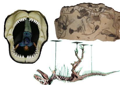
Show March 16-17

The club meetings are held the 3rd Tuesday of each month from September through November and from January through May at 7:15pm at the Rockwell Collins 35th St Plant Cafeteria, Cedar Rapids, IA. The December meeting is a Christmas dinner held on the usual meeting night. June, July, and August meetings are potlucks held at 6:30pm at area parks on the 3rd Tuesday of each month.