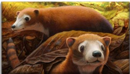
A reconstruction of Militocodon lydae .

Meet the newly discovered species Militocodon lydae : Thought to be about the size of a rat and weighing up to 455 grams, or 16 ounces, this small mammal is the likely ancestor of all modern hoofed animals, called ungulates . The animal would have lived around 65 million years ago, appearing just after the extinction of the dinosaurs, and was identified from part of a skull and jawbone recovered from