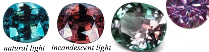
natural light incandescent light

June has three official birthstones, moonstone, pearl, and alexandrite. Of these, I think that alexandrite is the most interesting, so that is the birthstone that will be discussed this month. A relatively modern gem, alexandrite was discovered in Russia's Ural Mountain emerald mines. Legends claim that it was discovered in 1834 on the same day that future Russian Czar Alexander II came of age, hence the name honoring him. Because this unique gemstone changes colors from green to red ( see example above ), the national colors of Russia, alexandrite became Imperial Russia's official gemstone. Sometimes described as " emerald by day, ruby by night ," alexandrite is a rare variety of the mineral chrysoberyl (an aluminate of beryllium with the formula \text{BeAl}_2\text{O}_4 ), a strongly pleochroic (trichroic) gem that will exhibit emerald green, red, and orange-yellow colors depending on viewing direction in partially polarized light. After Russia's mine deposits were exhausted, the popularity of alexandrite waned until new supplies were discovered in Brazil in 1987. Brazil, Sri Lanka and East Africa are now the main sources for alexandrite, though these are not as vividly colored as the original Russian stones.