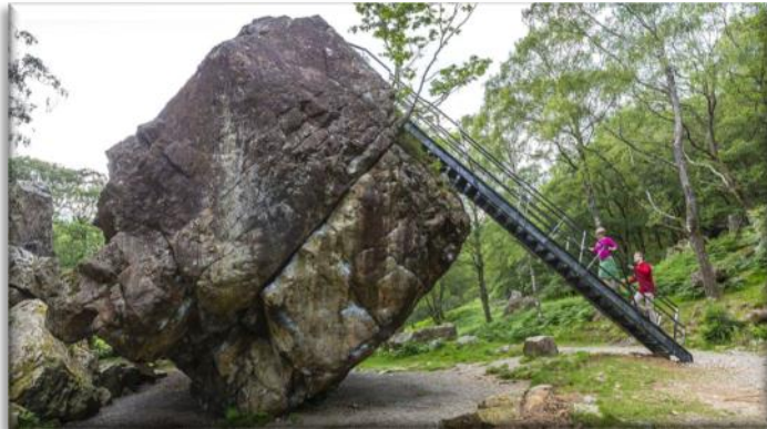
What in the World is this giant balanced rock and what is its history??