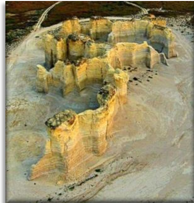
Last month's What in the World photograph was Monument Rocks, also known as the Chalk Pyramids, a series of chalk formations in Gove County, Kansas, that are rich in fossils. The rocks are up to 50 feet tall and 300 feet deep, and were formed from sediment that settled on the floor of an inland sea about 80 million years ago. The rocks are a reminder of a time when the region had more water