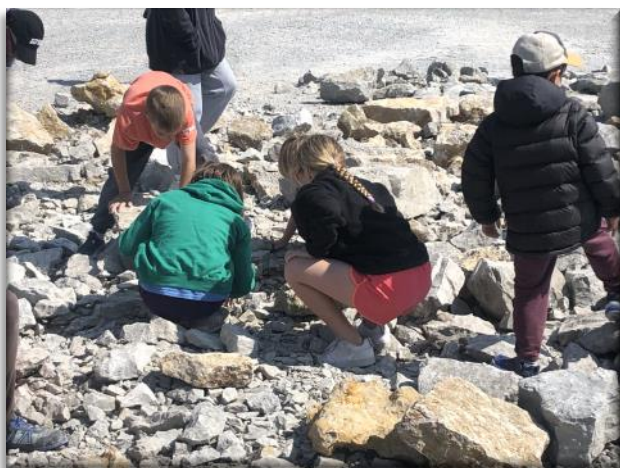
TAKO kids discover their own rock treasures among the quarried rocks piles in the parking area.

A variety of activities was available for the kids, including photo display of quarry operation, rock product produced, discussion and display of area rocks and fossils. They collected a variety of souvenirs, including “hard hats”, reading materials, plaster casts of fossils, sample bags, and rock samples. About 90 attendees took guided tours of the quarry on custom viewing trailers, and ended their tour exploring quarry rocks piled in a parking area. CVRMS members were there to answer questions from the would-be geologists, who were especially excited to find specimens of pyrite and calcite (from the Ernst Quarry salted into the piles).