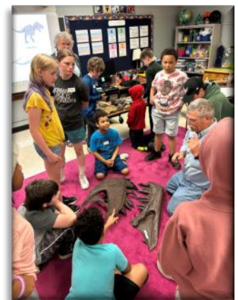
Casts of the upper and lower jaw of a T-Rex skull were a hit