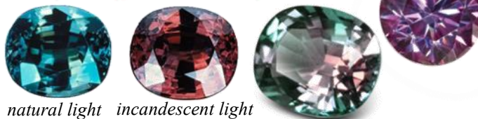
natural light incandescent light

June has three official birthstones, moonstone, pearl, and alexandrite. Of these, I think that alexandrite is the most interesting, so that is the birthstone that will be discussed this month. A relatively modern gem, alexandrite was discovered in Russia’s Ural Mountain emerald mines. Legends claim that it was discovered in 1834 on the same day that future Russian Czar Alexander II came of age, hence the name honoring him. Because this unique gemstone changes colors from green to red (see example above), the national colors of Russia, alexandrite became Imperial Russia’s official gemstone. Sometimes described as “emerald by day, ruby by night,” alexandrite is a rare variety of the mineral chrysoberyl (an aluminate of beryllium with the formula \text{BeAl}_2\text{O}_4 ), a strongly pleochroic (trichroic) gem that will exhibit emerald green, red, and orange-yellow colors depending on viewing direction in partially polarized light. After Russia’s mine deposits were exhausted, the popularity of alexandrite waned until new supplies were discovered in Brazil in 1987. Brazil, Sri Lanka and East Africa are now the main sources for alexandrite, though these are not as vividly colored as the original Russian stones.