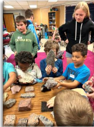
Students examine samples of various rock types