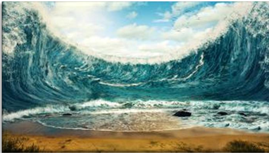
An artist's illustration of a tsunami wave poised to crash down upon a beach.

Climate change could unleash gigantic tsunamis in the Southern Ocean by triggering underwater landslides in Antarctica, a new study warns. By drilling into sediment cores hundreds of feet beneath the seafloor in Antarctica, scientists discovered that during previous periods of global warming, 3 million and 15 million years ago, loose sediment layers formed and slipped to send massive tsunami waves racing to the shores of South America, New Zealand and Southeast Asia. And as climate change heats the oceans, the researchers think there's a possibility these tsunamis could be unleashed once more. Their findings were published May 18 in the journal Nature Communications . "Submarine landslides are a major geohazard with the potential to trigger tsunamis that can