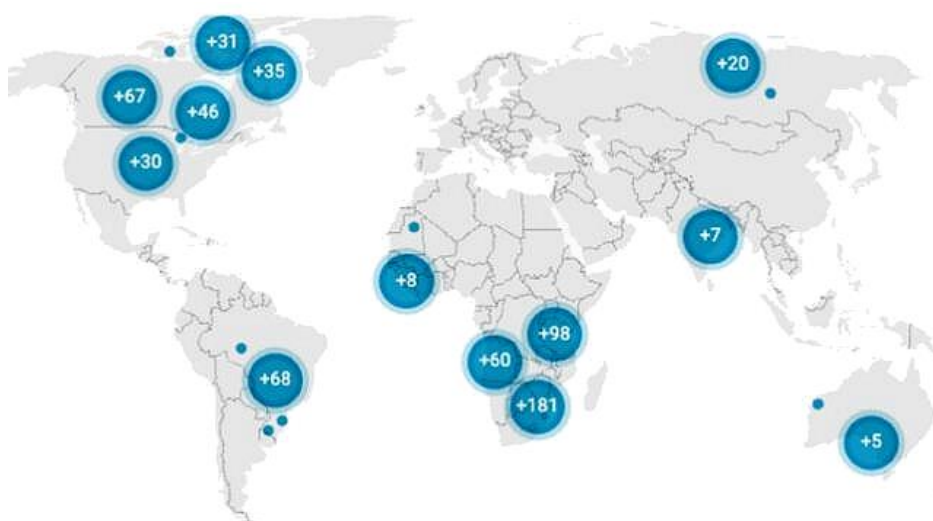
Kimberlite eruptions in the past 200 million years.